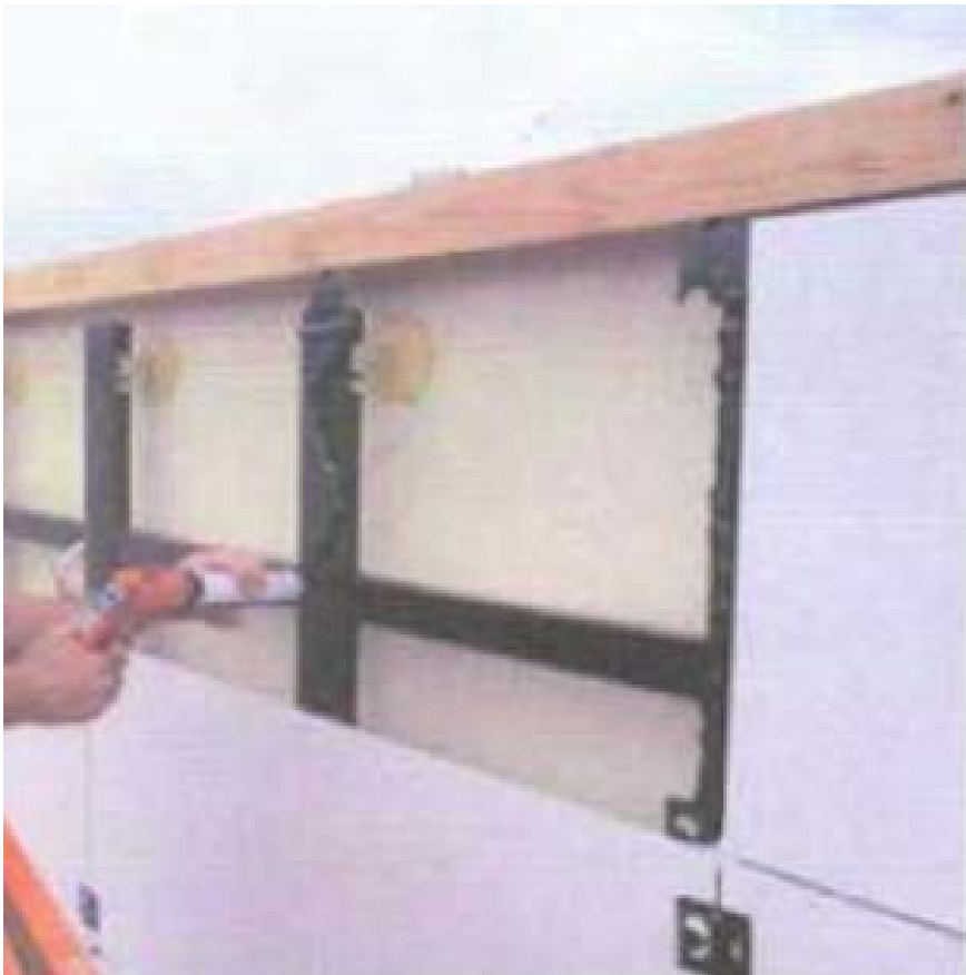
FIGURE 4—TYPICAL INSTALLATION